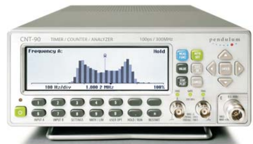
Figure 6: The same result as in figure 5, now displayed as a histogram.