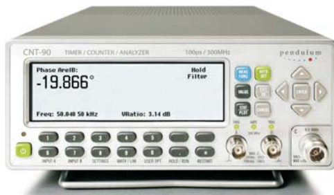
Figure 1: Display showing phase value, frequency, attenuation V_A/V_B , and auxiliary parameters.

When adjusting a frequency source to given limits, the graphic display gives fast and accurate visual calibration guidance.