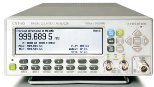
Figure 4: Display showing different statistical parameters viewed at the same time.