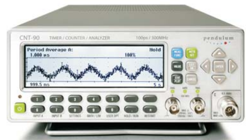
Figure 5: Display showing the trend (signal over time) of sampled data.