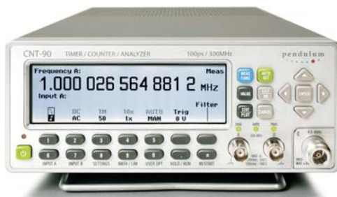
Figure 3: Input parameter setting menu shown with measured result.