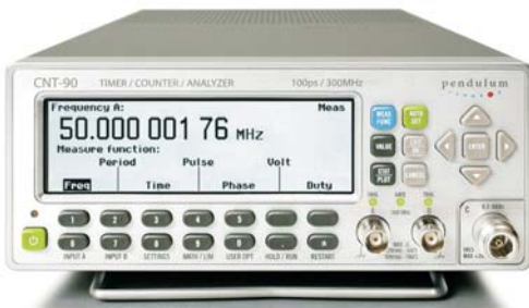
Figure 2: Measure function selection menu, shown with measured results.